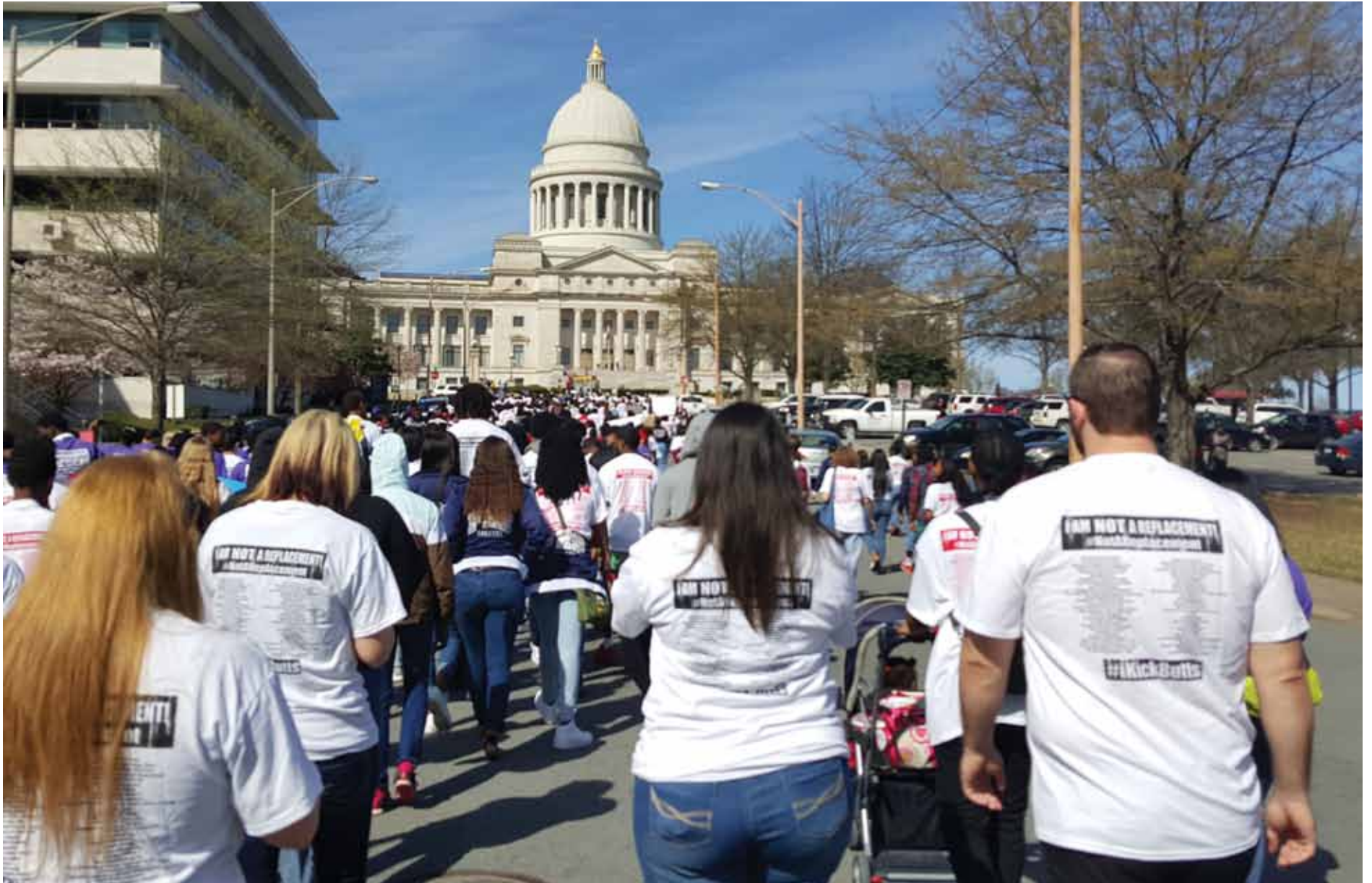
This past March, more than 1,000 youth members of the Arkansas Youth Leadership Initiative marched silently to the Capitol donning signs that read “I am not a replacement” to raise awareness of the dangers of tobacco.

involvement, new opportunities like YES On the Hill have arisen. This summer program immerses students in the legislative process so they can learn how to influence policy change regarding tobacco use in Arkansas.