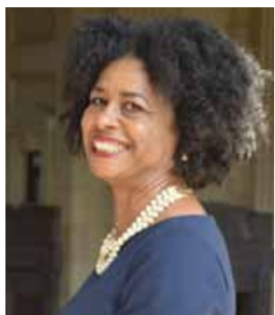
By Katherine Donald Executive Director Coalition for a Tobacco Free Arkansas

S moking, the leading cause of preventable death in the U.S., kills more than 400,000 smokers annually, including 5,800 Arkansans. In Arkansas, 24.7% of the adult population and 15.7% of high school students smoke. The national average is 15.1% and 10.8% respectively. Over 80% of all smokers start before the age of eighteen, the majority are hooked before they reach adulthood.